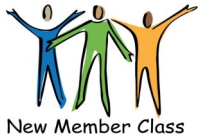
New Member Class

Many dates are open throughout the year. Please contact the church office, email office@trinitylatrobe.com or 724-537-4450. Whole broadcasts are $80 and a half is $40. Altar flowers will beautify our worship space and can be ordered from your local florist.